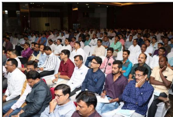
Labham Kolkata – 27 th June 2017