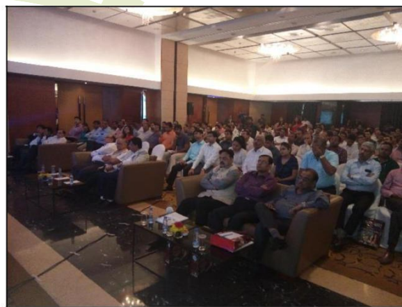
Labham Jamshedpur – 8 th August 2017