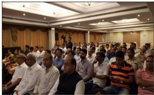
Labham Dehradun – 18 th June 2017