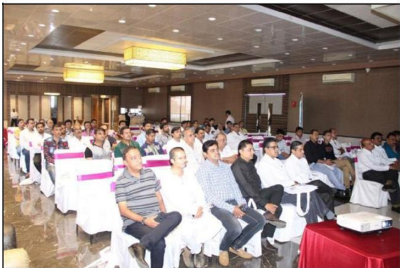
Labham Ulhasnagar – 23 rd May 2017